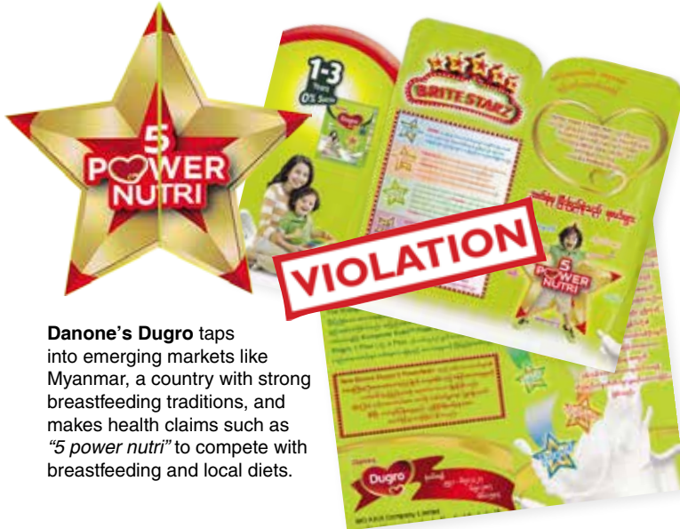
Danone's Dugro taps into emerging markets like Myanmar, a country with strong breastfeeding traditions, and makes health claims such as “5 power nutri” to compete with breastfeeding and local diets.