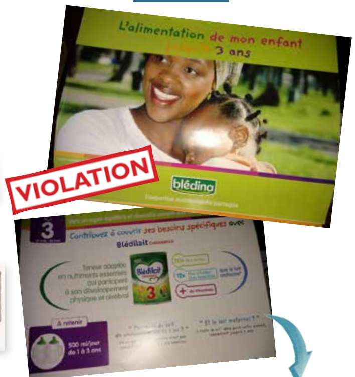
Brochure of Danone's Blédina promotes products for children 1-3 years. It also asks, “and breastmilk?” the answer says it is ideal for your child up to 2 years ... but a reminder tells mothers that every day, a baby needs 500ml (2 bottles) of “growing-up milks”.