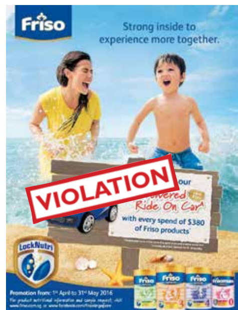
Get a free ride with every purchase of Friesland’s Friso participating products including Friso 3 growing-up milk. (Promotional offer worth S$380 in Singapore).