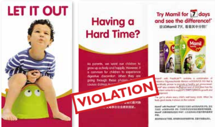
Brochure on Danone's Mamil uses claims to manipulate parents' fear of health problems.