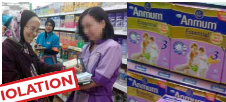
(right) Annum promoter approaching pregnant women for their personal information. Fonterra’s Annum No. 3 milks are heavily promoted in retail outlets in South East Asia.

“Marketing of GUMs may be considered misleading as it creates doubts on the nutritional adequacy of ordinary foods” (EFSA, 2013)