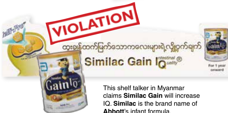
This shelf talker in Myanmar claims Similac Gain will increase IQ. Similac is the brand name of Abbott's infant formula.