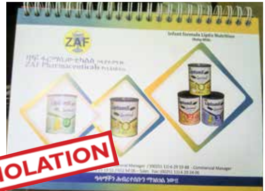
A desk calendar in a hospital in Addis Ababa advertises the full range of Liptomil formulas including GUMs.

“There is growing concern and evidence that inappropriate promotion of breast milk substitutes and some commercial complementary foods and beverages for infants and young children has been undermining progress in optimal infant and young child feeding.” - WHO