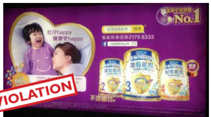
Nestlé says “Happy tummy, happier baby” about their products in the Hong Kong subway terminal.